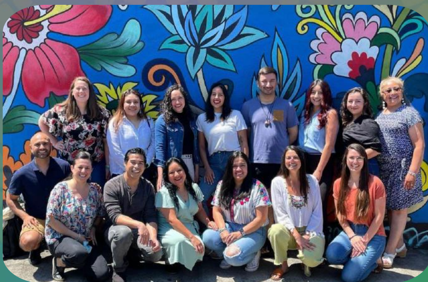
Familias en Acción Team

As we continue to serve the needs of our Latino/x/e community members who experience some of the greatest health challenges, we are reminded of the urgency of our programs and services. This report highlights Familias en Acción's efforts to not only serve the needs of our community members and impact how the healthcare system delivers services, but to give power back to our people through greater access to health education and resources and our collective advocacy work.