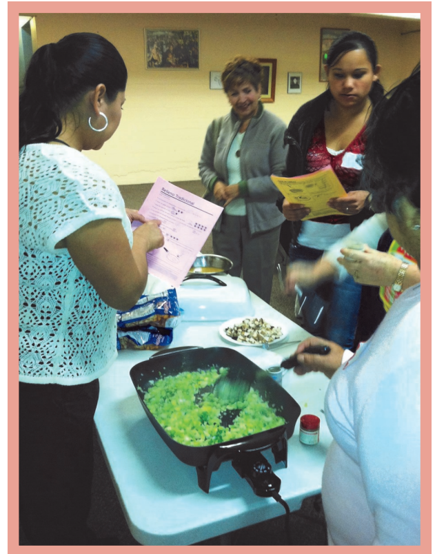
Participants in the Familias en Acción Support Group review new recipes and learn techniques to make their favorite meals with healthy changes.

Funding by the Leukemia/Lymphoma Society supports our monthly cancer support group for survivors and their family members.