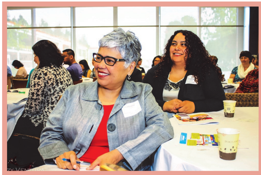
Attendees of the Latino Health Equity Conference, Familias en Acción's annual training for health professionals. The conference focuses on Latino health issues regarding research, policy, and clinical care.

There were 15 workshops presented which provided a forum for public health researchers, policy makers, care providers, and students to engage. These 300 participants at our conference were able to share strategies and best practices regarding health equity for Latinos.